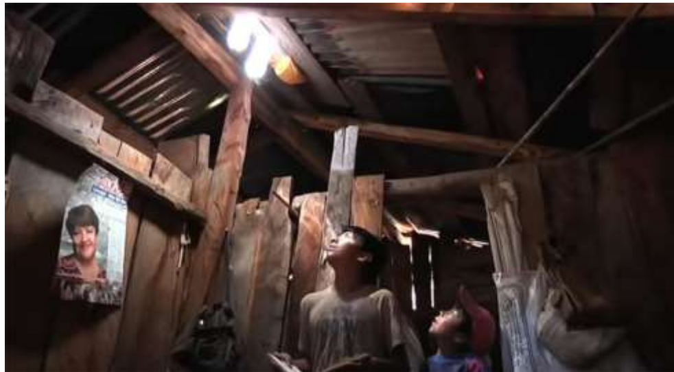
Figure 4. Illustration of Moser lamp (8)

How does it work? The bleach keeps the water from turning green, and the water refracts sunlight. Chilean Miguel Marchand helps to install the bottle lights, or Moser Lamps, in the home of a family that lives in the Andes.