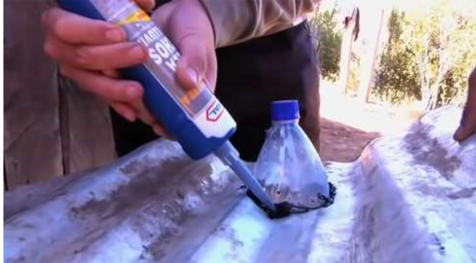
Figure 5. Installation process of Moser lamp (8)