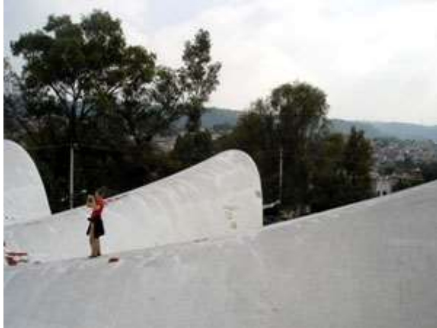
Illustrations 1-3. Several key designs of Felix Candela